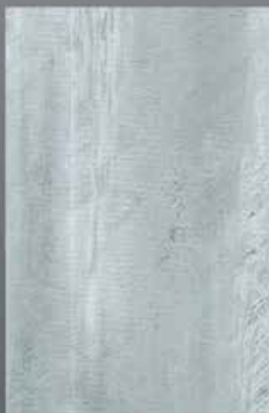
58324-2 Sierra White 300 x 600mm