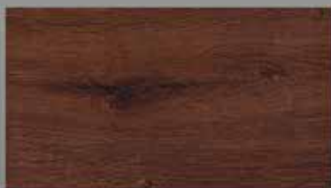
588760 Oak Dark