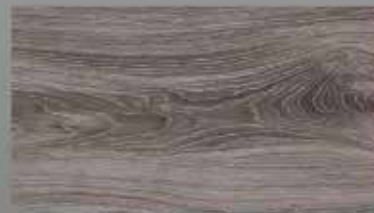
587425 Gordon Oak