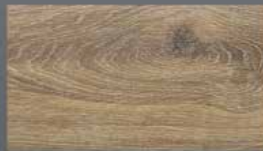
587428 Sessile Oak