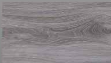
587424 Northland Oak Grey