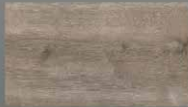
581310 Bologna Oak