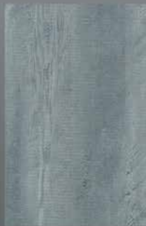
58324-9 Sierra Grey 300 x 600mm