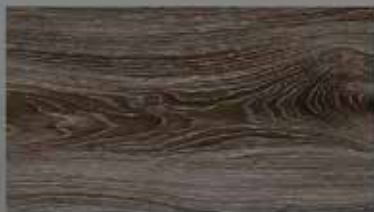
587426 Barbarossa Oak Dark