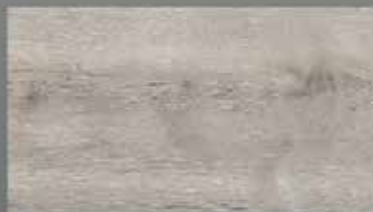
581312 Tuscany Oak