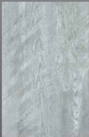
58324-3 Sierra Ash 300 x 600mm