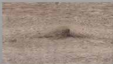
588713 Oak Silver