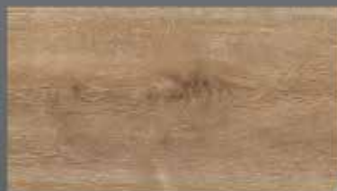
581302 Florence Oak