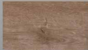
588719 Oak Brown