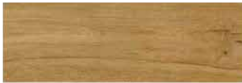
725110 MARKHAM OAK LIGHT