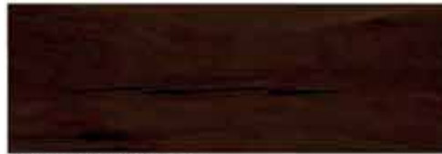
72516 KENTUCKY OAK