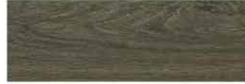
63696 DURBAN OAK