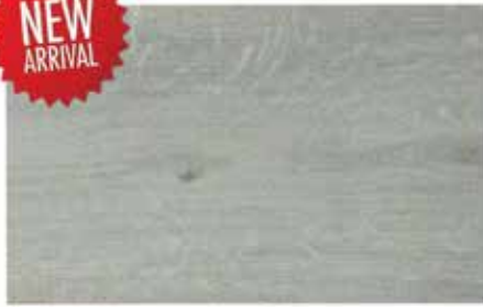
978109 Amsterdam Silver