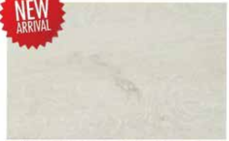
978104 Amsterdam Egg Shell