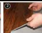
Angle the second plank and align the interlocking strips