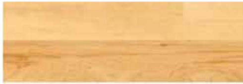
187214 RUSTIC MAPLE