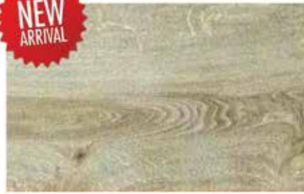
978103 Amsterdam Light Tan