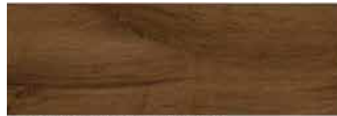
72513 MARKHAM OAK MEDIUM