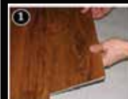
Position the 2 planks