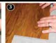
Press down and lock into place